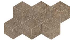
Material 07 3D Décor