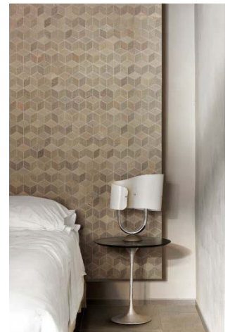
Material 05 3D Décor