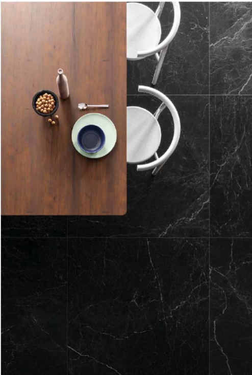
Marquina Black Lux