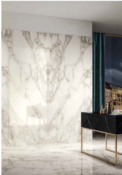
Arabesque Bookmatch A&B